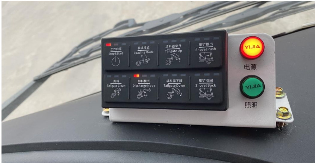
(Figure8: Discharge Mode)

3.1 Turn on the PTO switch and power switch of the cabin operation panel according to the mentioned above operation. (1.1---->1.3)