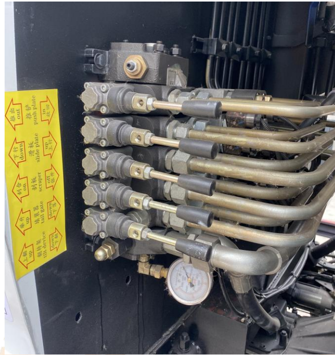
(Figure9: Manual emergency lever)

(emergency use in case of electrical system failure)