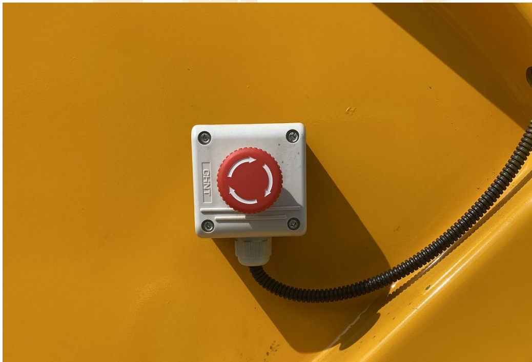
(Figure7: emergency stop switch)

In case of emergency, turn on the emergency stop switch, and the scraper and skateboard will stop working at any position immediately .