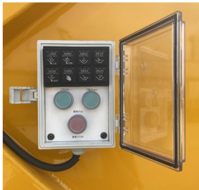
(Figure5: Operation box)

2.2 Get out of the cabin and walk to the right rear of the truck to continue operation.(see figure5)