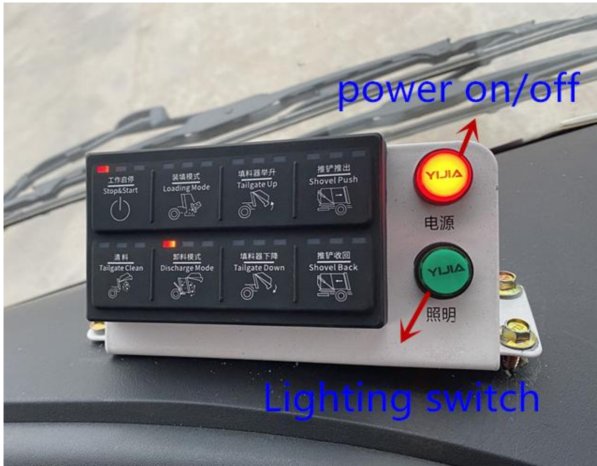
(Figure 3: operation panel is in the truck cabin)

1.3 Press the power switch on the operation panel (see figure 3), the power indicator light will be bright to prove the power is ready for operation.