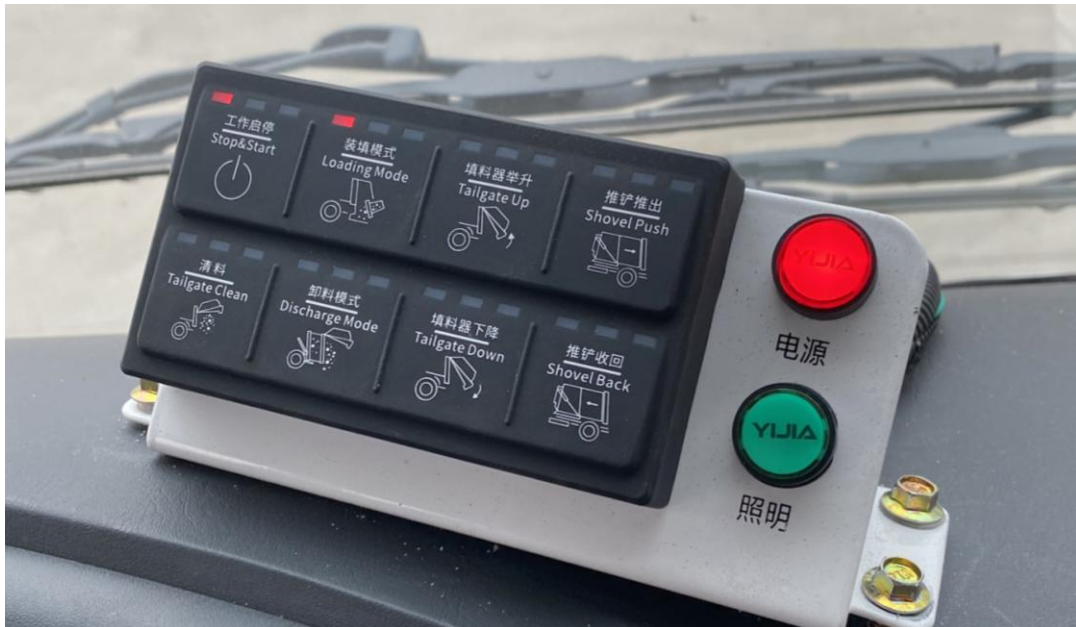
(Figure 4: Loading Mode)

2.1 Press Start switch and the loading mode, then these two switch indicator light is bright. ( see figure 4)